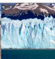
Glacier Perito Moreno