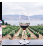
Wine Region in Mendoza