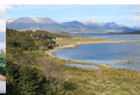
Tierra del Fuego National Park